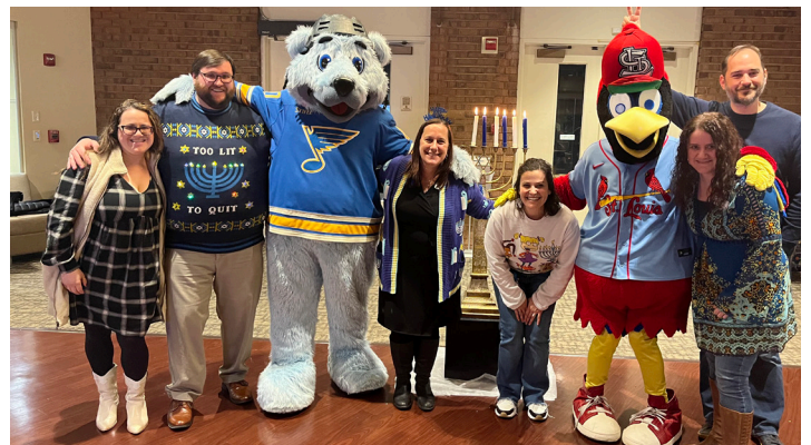
Mascots and Menorahs