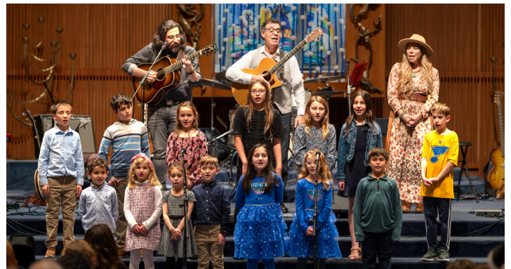
Youth Choir Performs with Nefesh Mountain