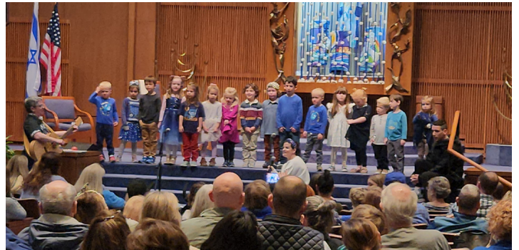
SSECC Chanukah Performance