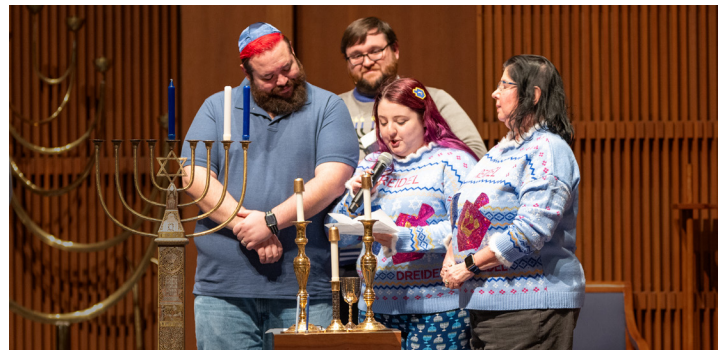
Shabbat Lighting of the Menorah